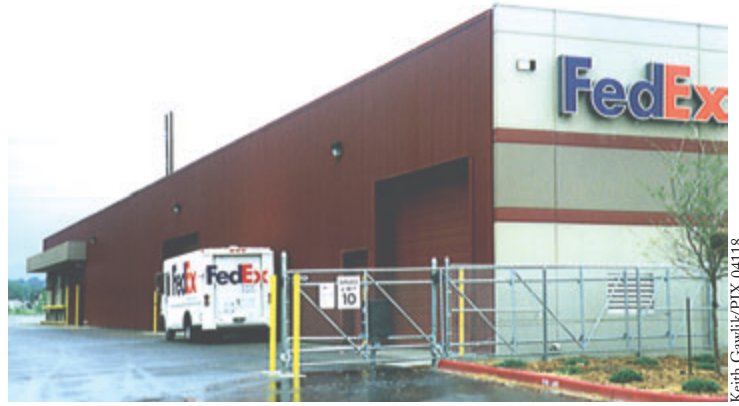
Keith Cavallie/PIX 04118

The transpired air collector is easier to use, lower in cost, and more efficient than previous flat-plate solar air collectors made with glazing. Transpired collectors